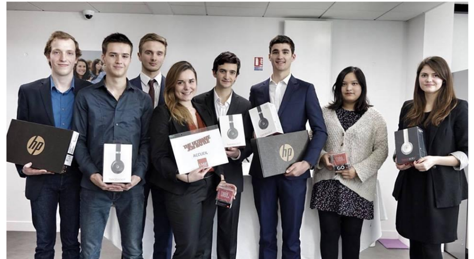
Inter Campus Events: Job battle Caen 2017