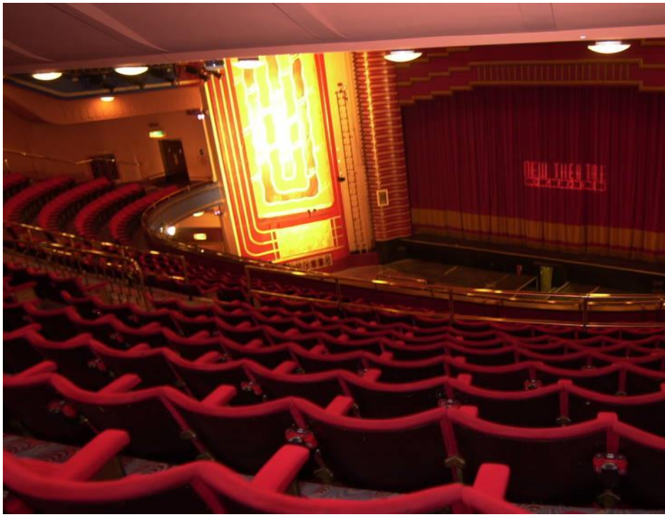
New Theatre Oxford (Musicals, Ballet, concerts)

http://www.atgtickets.com/venues/new-theatre-oxford/