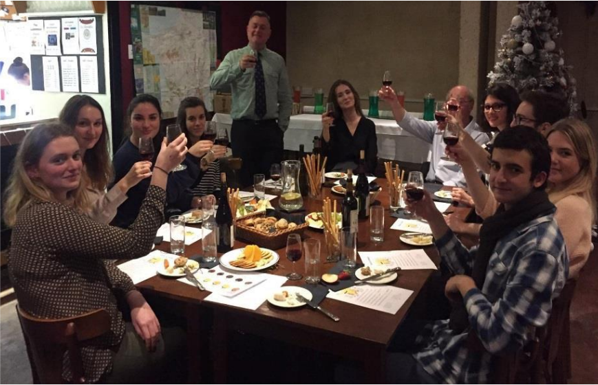
Wine club events