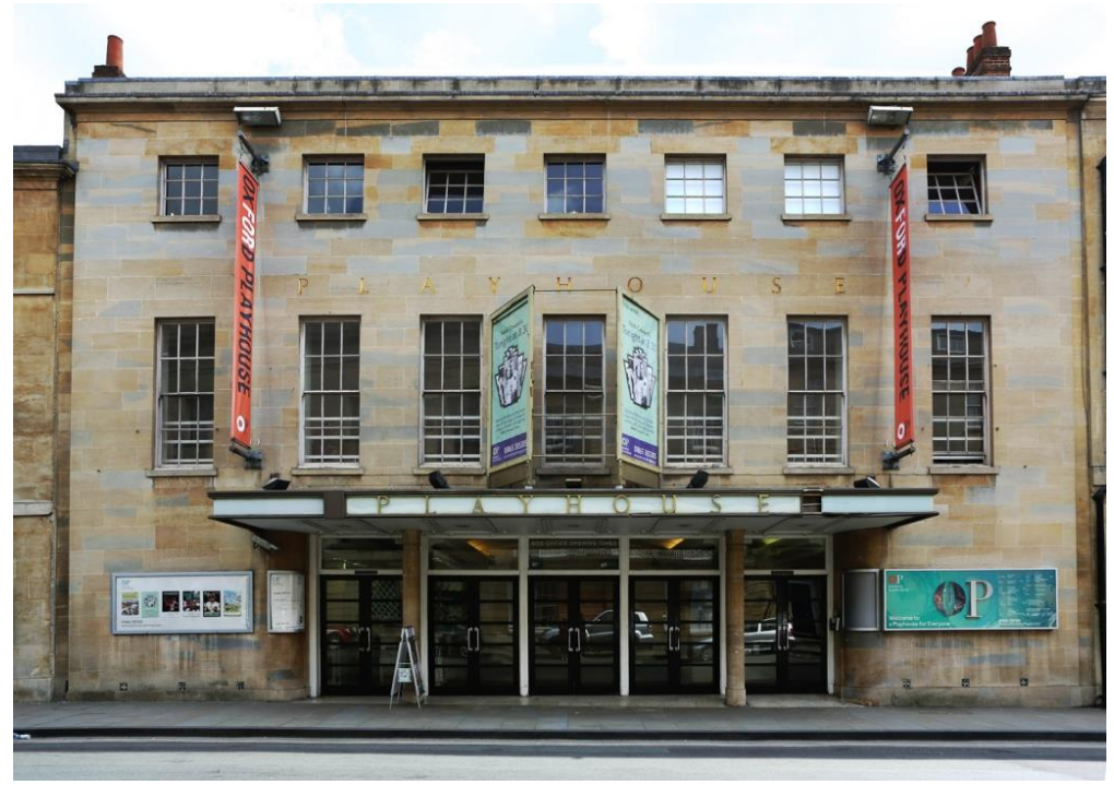
The Oxford Playhouse (Theatre)

http://www.atgtickets.com/venues/new-theatre-oxford/